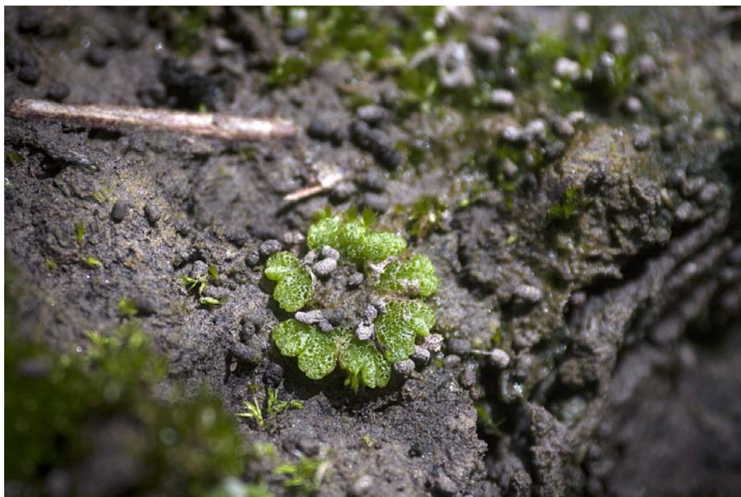
Figure 4. A very small population of the liverwort Riccia cavernosa was registered on an area of about 5 m 2 , on the remains of a fire next to a footpath, near the restaurant Šas.