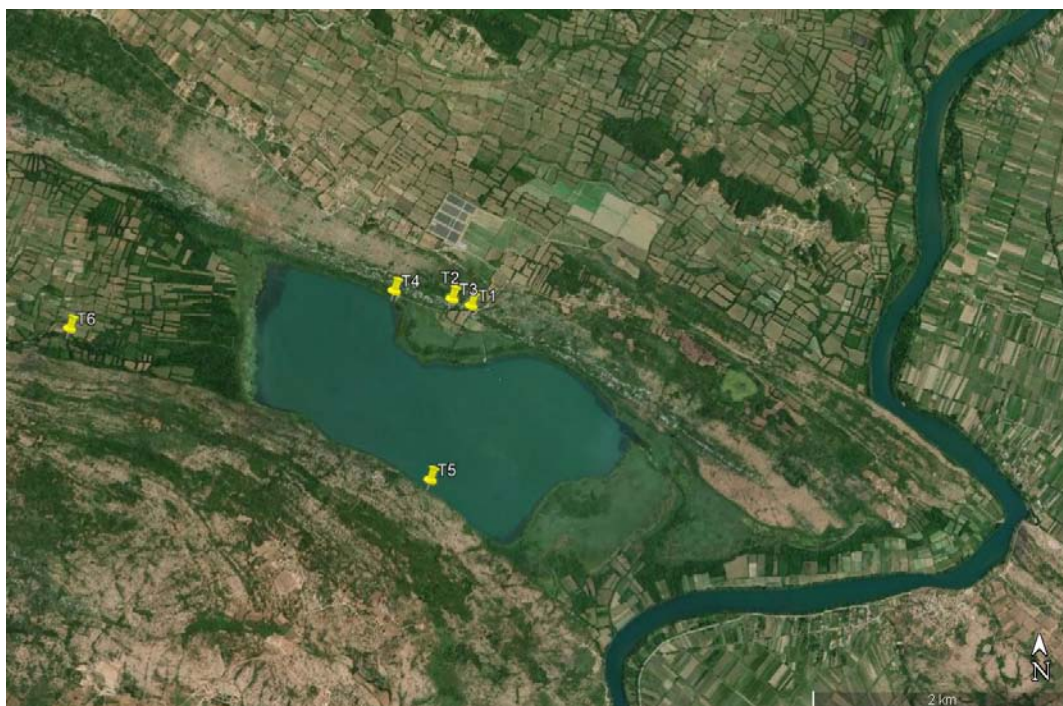
Figure 1: Map of the investigated area with charted localities (points) where moss sampling was performed.

The research was conducted in the northern and southern and south-western parts of Šasko Lake (fig. 1), at a total of six points ( T_{1-6} ). The Results section contains data for each point at which the material was sampled: sampling date, coordinates, altitude, habitat, substrate). The eastern coast is inaccessible (wetland area, macrophytic vegetation), and the western part consists mostly of cultivated, planted areas or fenced meadows.