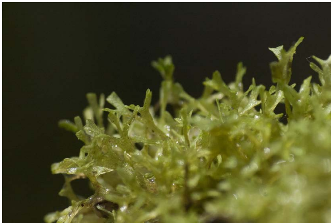
Figure 5. Riccia fluitans was found on the northern shore of the lake, in water and on rotten twigs, out of water, together with Fontinalis antipyretica and Reboulia hemisphaerica.