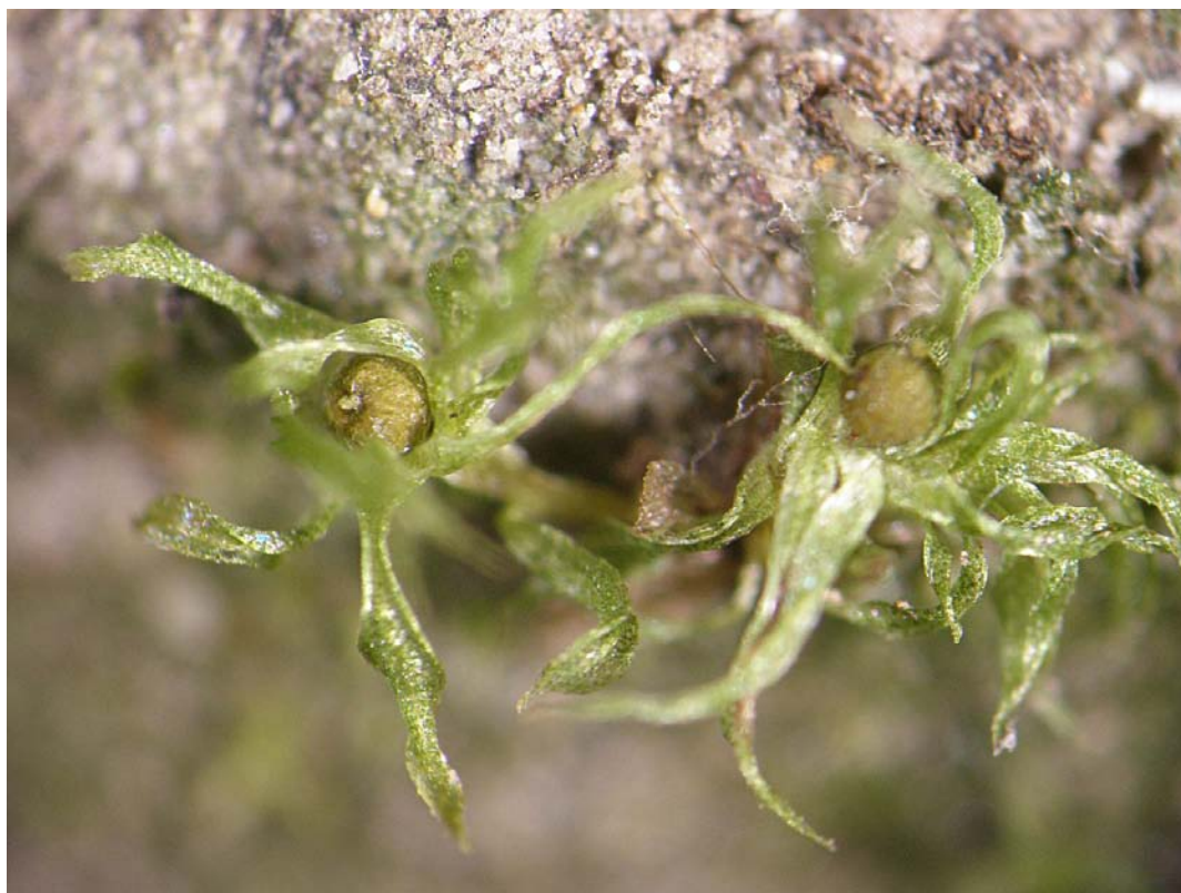
Figure 3. Physcomitrella patens with sporophyte.

The findings of species of the genus Riccia are quite interesting, as they are not widespread in Montenegro; moreover, their populations are generally not numerous. For example, Riccia cavernosa (fig. 4) was first recorded for the moss flora of Montenegro as a very small population on the island at the confluence of the artificial branch of the Morača River and Skadar Lake (Dragičević, 2008). Later it was recorded only in the hinterland of Velika plaža, in Ulcinj (Grupa autora,