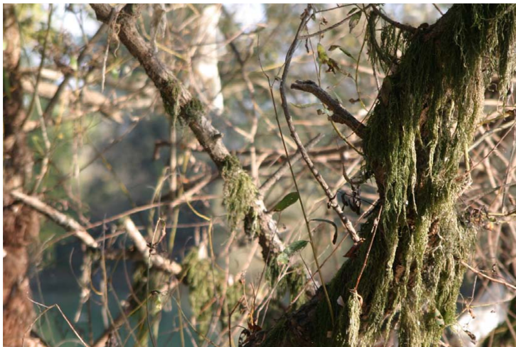
Figure 2. Willow tree with Fontinalis antipyretica as epiphyte, a good indicator of clean water.

The paper presents 26 mosses and 7 liverworts. Most of the species have already been recorded in numerous other places in Montenegro. The mosses found during this year's field research are not protected by national and international laws. Fontinalis antipyretica is on the list Bryophyte Red of Serbia and Montenegro (Sabovljević et al., 2004) (fig. 2), and for Physcomitrella patens the area of Šasko Lake is the second finding in Montenegro (fig. 3), so its populations should be monitored in the coming period.